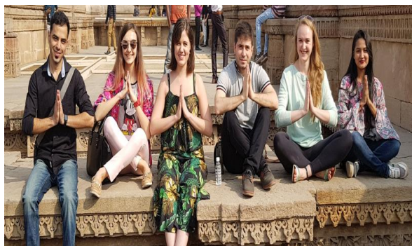
Foreign students at Gujarat Technological University during Winter School Program