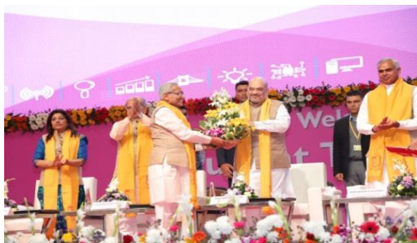
Shri Amit Shah, Hon'ble Union Home Minister, Government of India praised the efforts of GTU during 9 th Convocation ceremony on 11 th January 2020